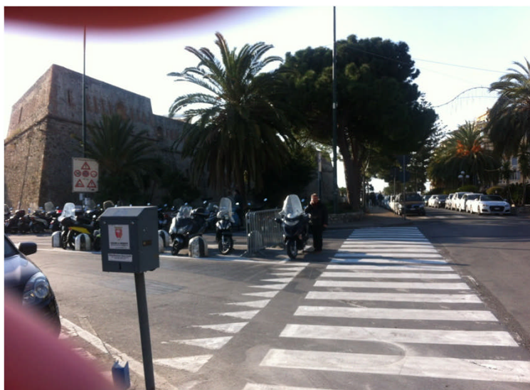
The Same Area Now